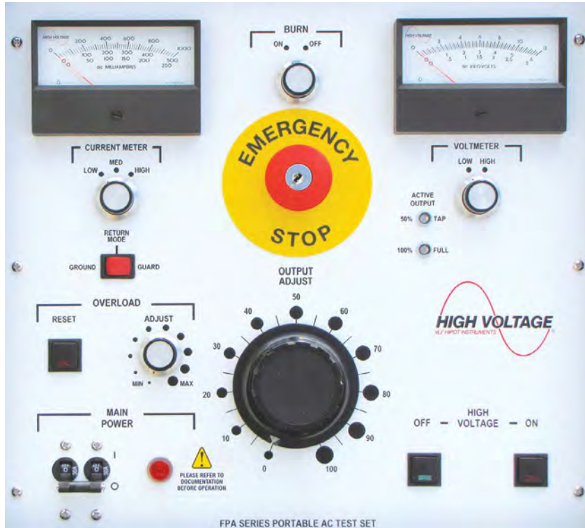
FPA SERIES PORTABLE AC TEST SET