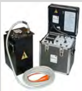
HVI DC Testers rated to 600 kVdc