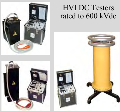
HVI DC Testers rated to 600 kVdc