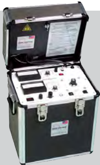
PTS-75 Model (0-75 kVdc, 10mA)

Two HV Portable DC Test Sets for the Price of One!