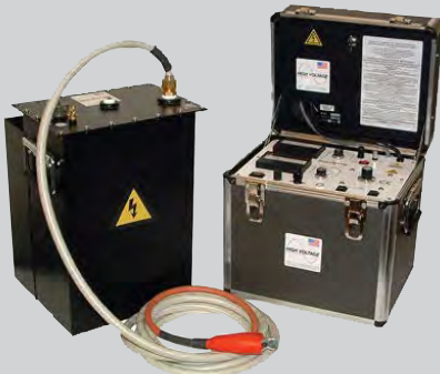
PTS-130 Model (0-130 kVdc, 10mA)