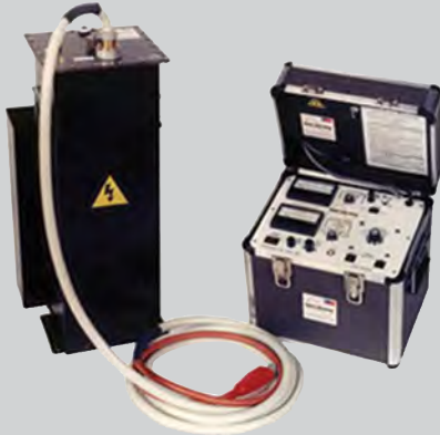
PTS-200 Model (0-200 kVdc, 5mA)