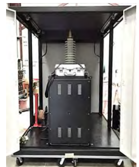
Custom container designed and produced by HVI to house VLF-200CMF. Top is motor driven to open for HV output.