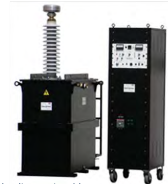
Truck produced by Inducor from Argentina with VLF-200CMF and generator. Partial Discharge and Tan Delta diagnostic cable testing products are provided by Power Diagnostix from Germany. Picture to the right is basic VLF-200CMF model.