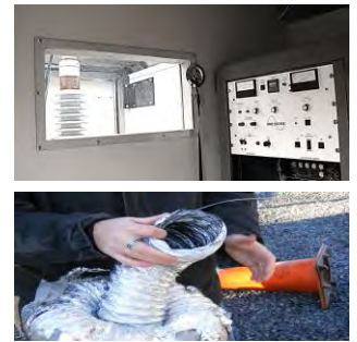
Van produced by HVI containing the VLF-200CMF with HV tank & controls in separate rooms and a 20 kW generator in separate section with noise deadening walls. Trailer top opens via motor driven chain system.