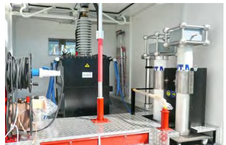
Trailer produced by Vital Drive from Cypress. Includes VLF-200CMF and Power Diagnostix PD and TD measurement equipment. Top opens to expose HV output.