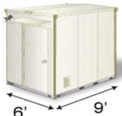
Possible shipping container size