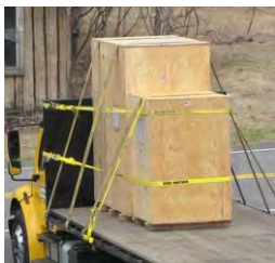
VLF-200CMF tank & controls shipping out