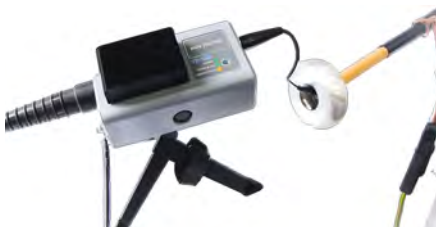
Model TD-34E Tan Delta Option