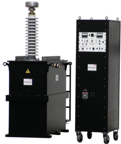
The standard configuration