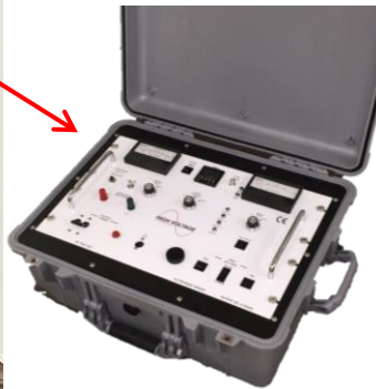
Field controller with 30' (10 m) interconnect cable