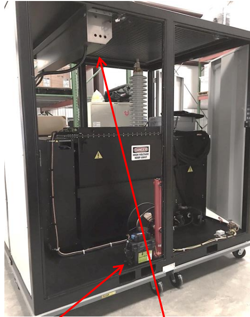
Battery used to operate motorized opening top for HV output connections