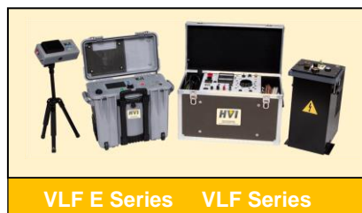
VLF E Series