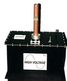
70 kVdc pri - sec Isolation Transformer