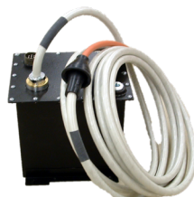
50 kVac @ 3 kVA Shielded Cable Out