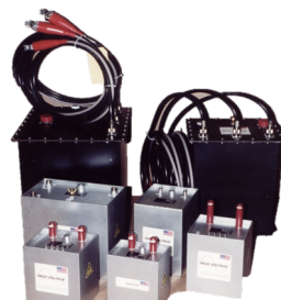
DC Power Packs 5 kVdc – 100 kVdc 3 mAdc – 20 mAdc