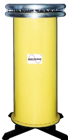
200 kVac @ 7 kVA

Various model series shown and some custom made. Consult the factory for information and availability.