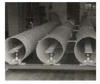
Iso Phase Buss