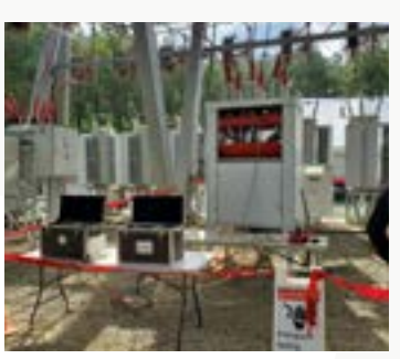
Switchgear and Circuit Breakers