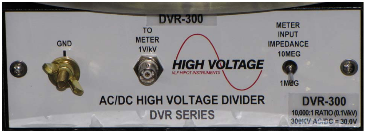
Figure 1 DVR Series panel.