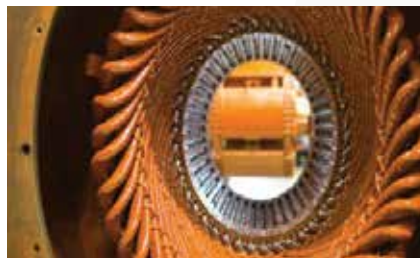
Motor & Generator Coil Testing