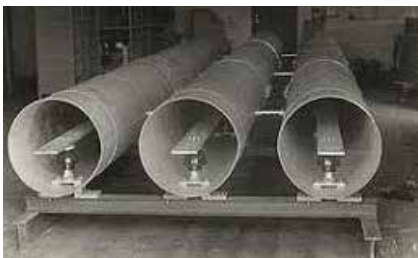
ISO Phase Bus & Switchgear Testing