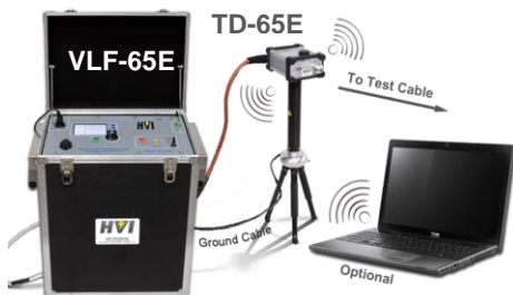
0.1 Hz. VLF: 0 – 65 kVac peak @ 10 uF load

VLF Tan Delta or Power Factor Testing: This is a " Diagnostic Test ", not a Pass/Fail or Go/No-Go test like a Withstand test where the load either holds the test voltage or fails. This test measures the level of insulation degradation, allowing the user to make educated decisions as to maintenance or replacement priorities. The test helps to learn something of value about the insulation while minimizing the potential for failure during the test. Measurements are made quickly, and the overvoltage is usually kept to less than 1.5 - 2 times normal. If the insulation between two conductors is