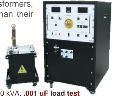
50/60 Hz: 0 – 50 kVac @ 200 mAac, 10 kVA, .001 uF load test

AC Withstand Test @ 50/60 Hz: Electrical apparatus, like switchgear, transformers, bushings, breakers, cables, etc. must be electrically tested at a voltage higher than their normal operating level, usually at least twice normal, to prove the insulation is not faulty and no failures will occur during use. This test is known as a hipot, proof, withstand, stress, go/no-go, pressure, or over voltage test. The object either passes the test by holding the test voltage or fails by flashing over or through its insulation. It's easy, quick, conclusive, and supported by IEEE standards and used everywhere. The use of DC voltage is not recommended.