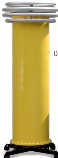
HPA-1010FC3 HPA-30020FC3 0-10 kVac @ 10 kVA 0-300 kVac @ 20 kVA