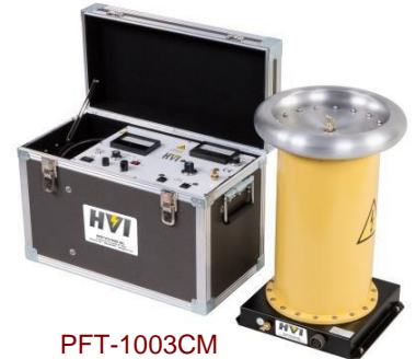
PFT-1003CM 0-100 kVac @ 3 kVA