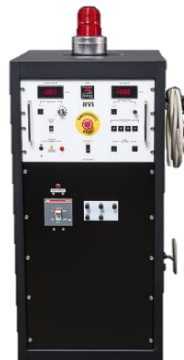
HPA-6010PC3 0-60 kVac @ 10 kVA Corona free < 10pc