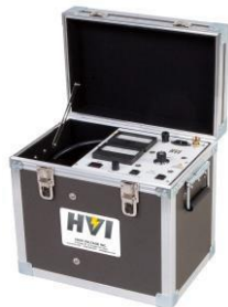
PFT-301CM 0-30 kVac @ 1 kVA