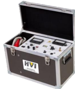
PFT-103CM 0-10 kVac @ 3 kVA