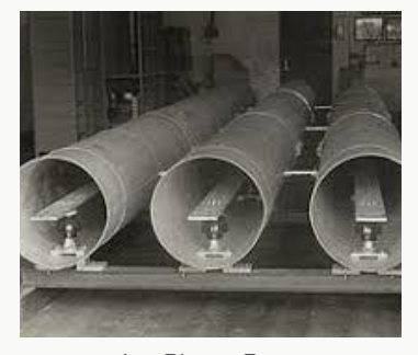
Iso Phase Buss