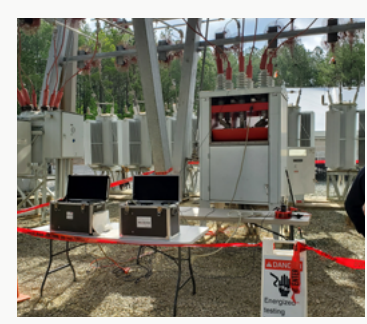
Switchgear and Circuit Breakers