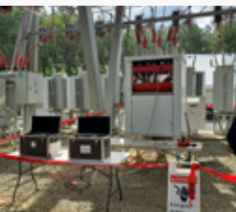
Switchgear and Circuit Breakers