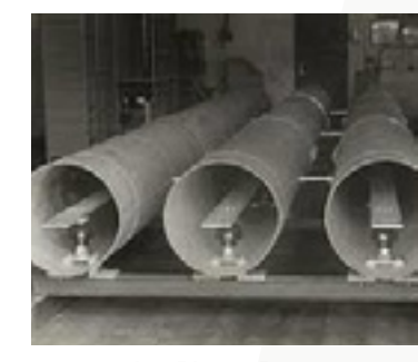
Iso Phase Buss