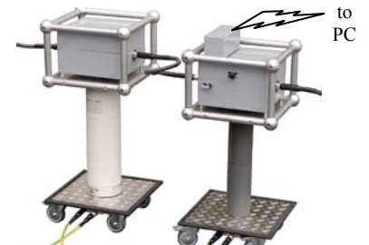
70 kV peak TD/PD system - PDIX 40 kV model also available

Medium Voltage PD/TD Models Used with lower voltage VLF testers