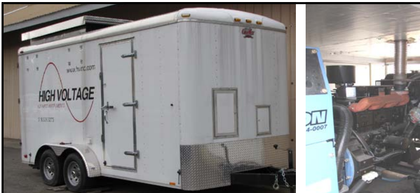
Trailer mounted VLF-200CMF. Includes retractable top to exit high voltage, separate room for controller, and 20 kW generator.

HVI produced VLF-200CMF Trailer w/Generator