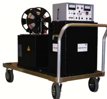
VLF-120CMF 0-120kV peak .55uF @ 0.1Hz – 5.5 uF @ .01 Hz