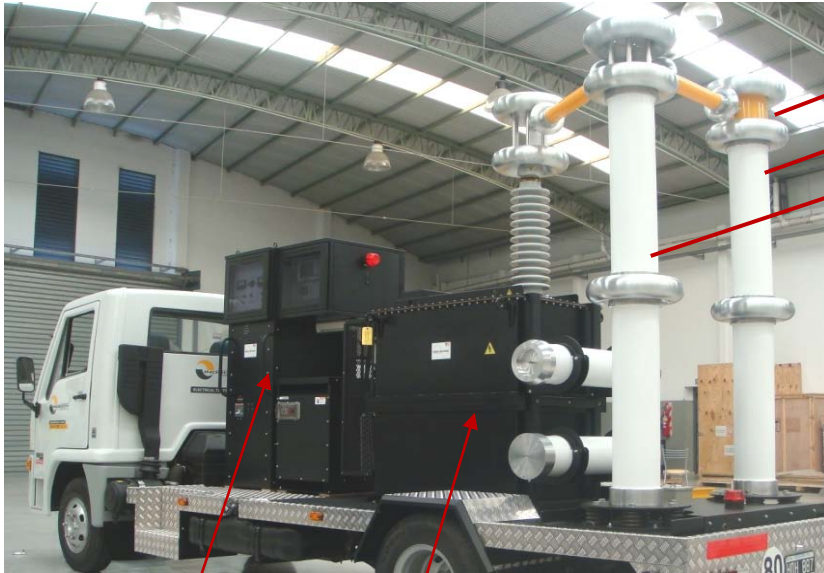
VLF Controls/regulator 200 kV VLF tank