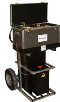
VLF-90CMF 0-90kV peak 55uF @ 0.1Hz - 2.75 uF @ .02 Hz